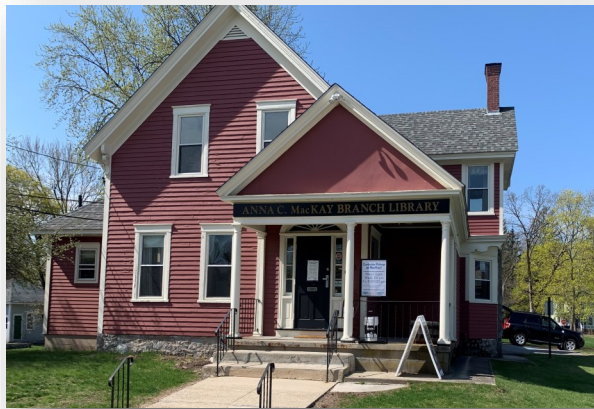
Current view of the MacKay Library 2023