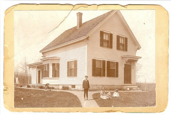
43 Newfield St, North Chelmsford, MA 01863